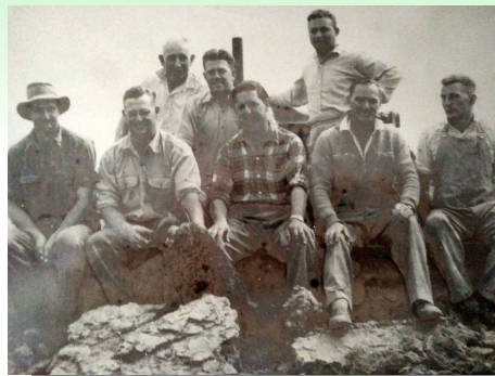
Volunteers taking a break whilst building the current course at Eagle Point (left).