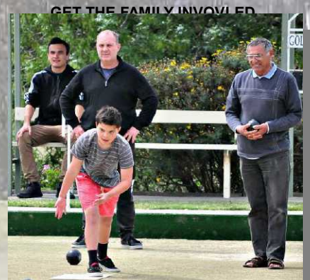
GET THE FAMILY INVOLVED